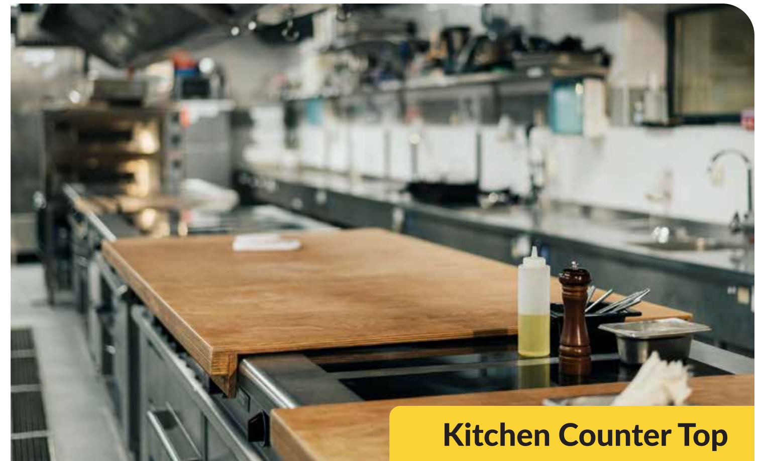
Kitchen Counter Top