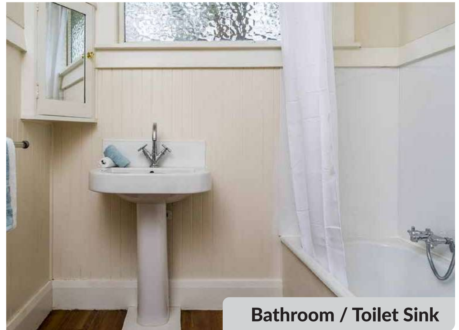
Bathroom / Toilet Sink