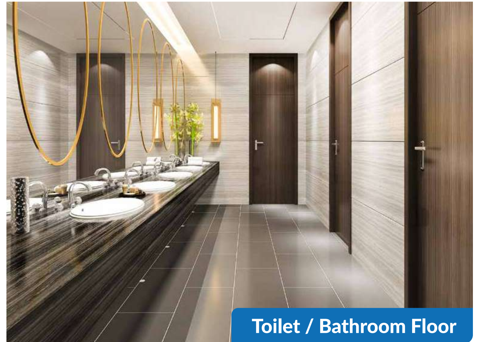
Toilet / Bathroom Floor