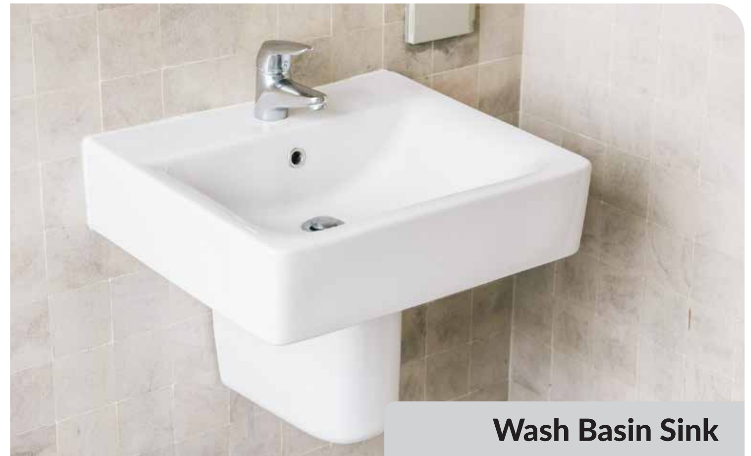
Wash Basin Sink