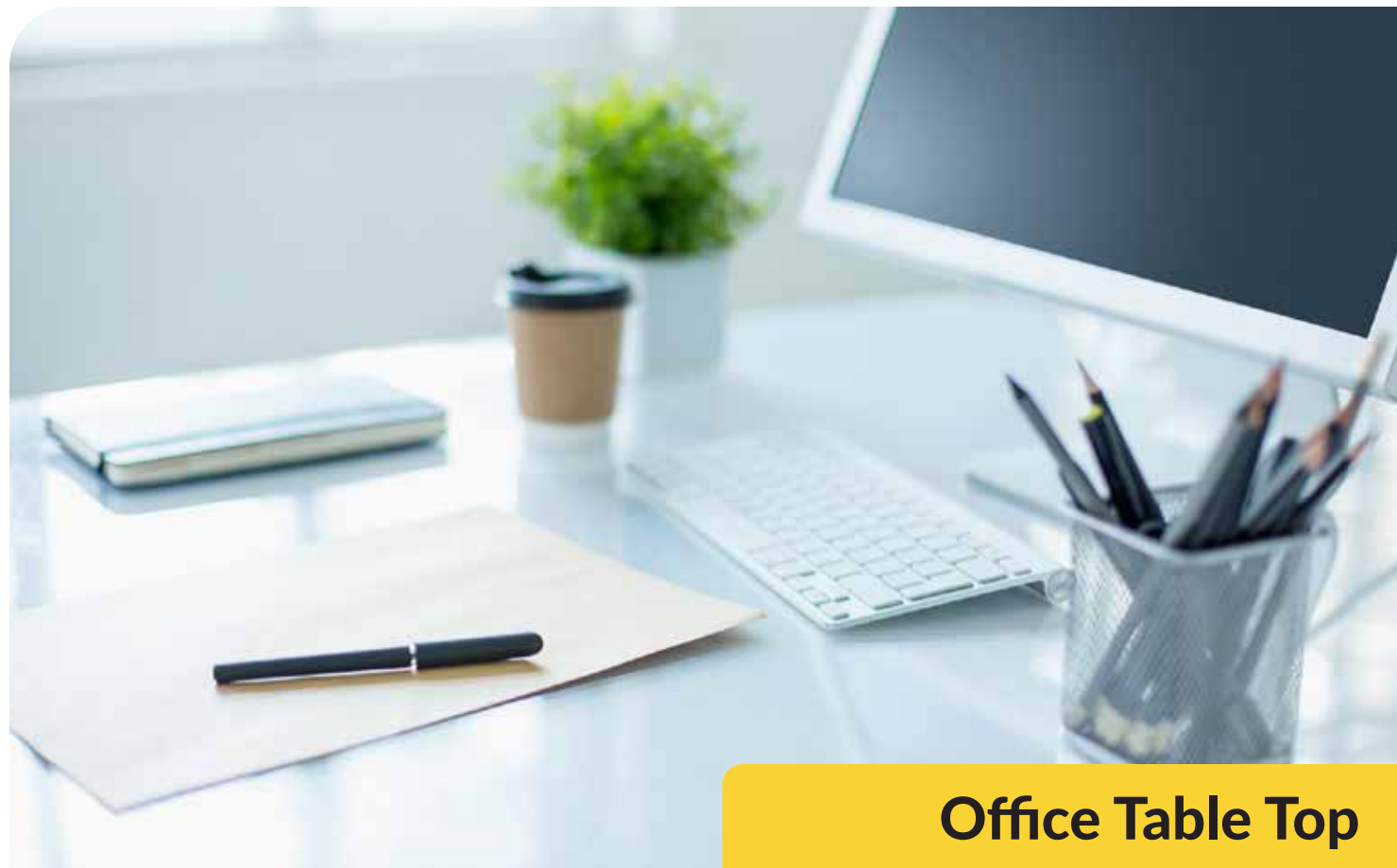
Office Table Top